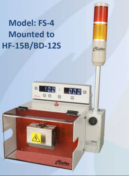
Model: FS-4 Mounted to HF-15B/BD-12S