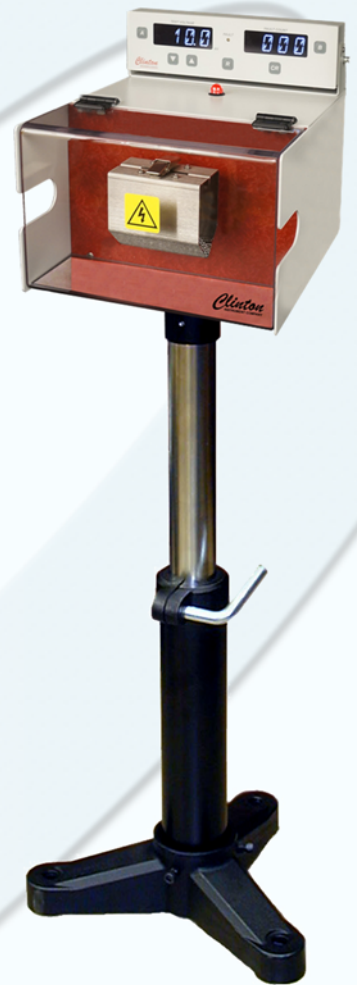
Model: HF-15B/BD-12S Mounted to FS-4

It is designed to be mounted permanently to the factory floor and is height adjustable to accommodate wire line heights from 27.75 to 42.25-inches. It is constructed from heavy cast iron and tubular steel. Some assembly is required. Floor mounting hardware is not included. Pictured at Right.